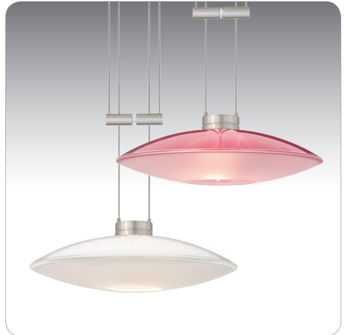
SPAZIO SHOWN IN OPAL GLOSSY (629406) & RED/FROST (6294RD)

ETL or UL Listed. Suitable for Dry Locations (interior use only).