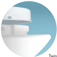
Twist and lock bayonet glass