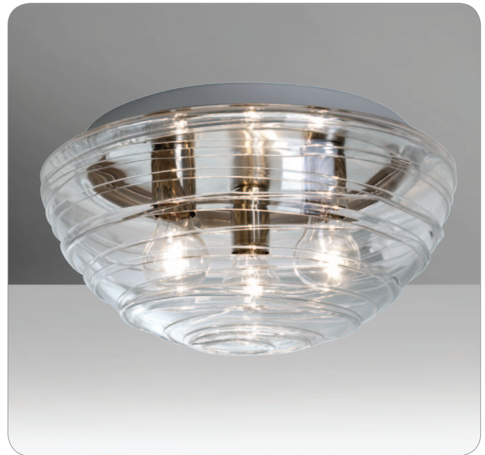
WAVE 15 CEILING SHOWN IN CLEAR (906361C)

UL or ETL Listed. Suitable for Damp Locations (interior use only).